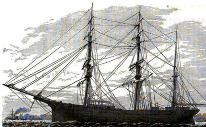
Above: Mercury image 8-Part history about that Hart Island reform school ship, NYS/NYC's first nautical training vessel, focus of Albany conference paper.