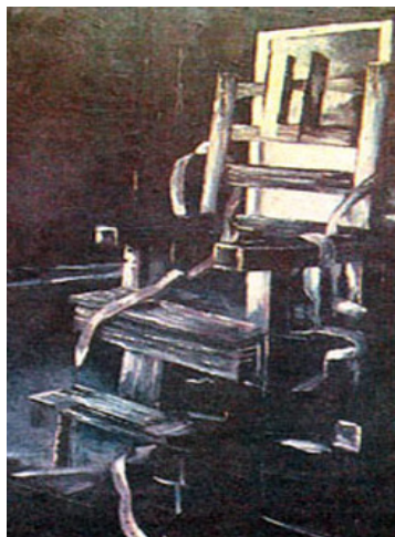
Electric chair image used as home page icon to access first Miskell archives item on-line.