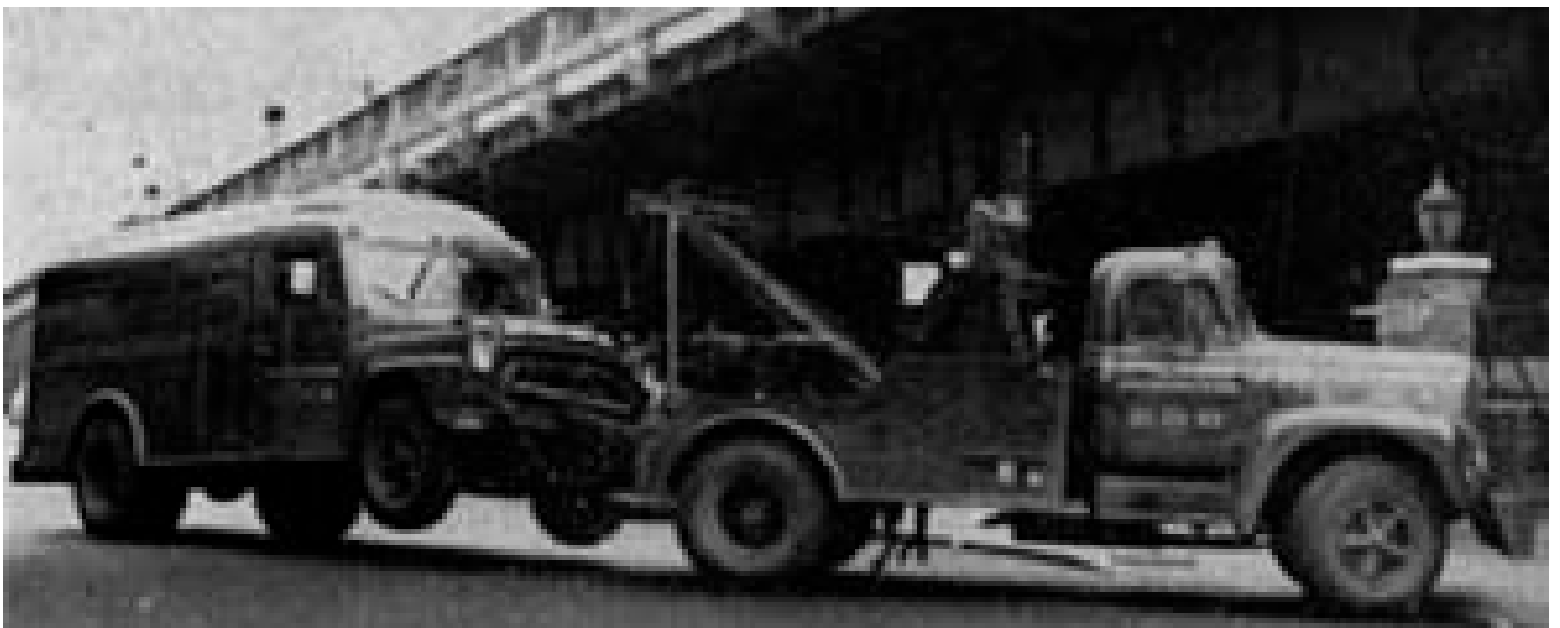
DCNY Transportation Division circa 1968

http://www.correctionhistory.org/html/museum/gallery/raymondst/rayfoto22.html