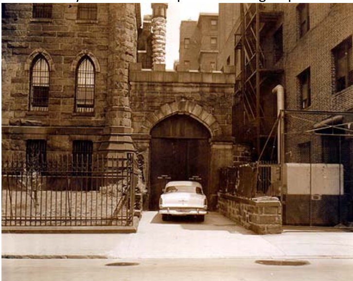
Raymond St. Jail virtual tour

WEBMASTER NOTE: Below are images from and links to pages on the Correction History website relevant to DCNY old-style inmate transport vans FB group discussion thread and the original post photos.