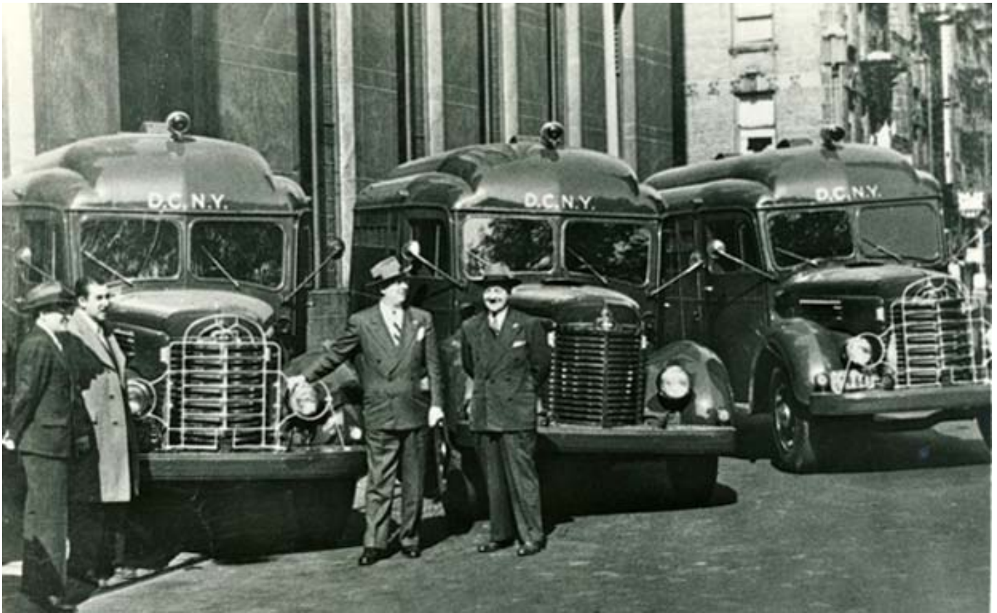
Ret. Asst. Chief Pagan Collection Page #3 Photo O: "Photo of the Old Tombs vehicles. Looks like taken on Baxter St. Tenement building behind vehicle far right is where the new Tombs is now situated."

http://www.correctionhistory.org/html/chronicl/nycdoc/pagan-pix/Chief-Pagan-DOC-Photo-Collection-Page-3.htm