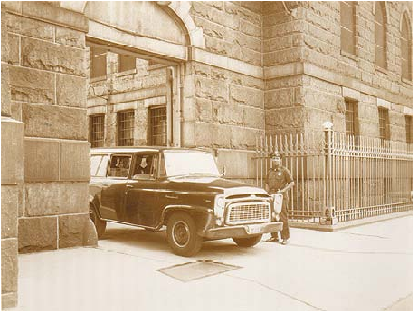
Raymond St. Jail virtual tour

http://www.correctionhistory.org/html/museum/gallery/raymondst/rayfoto22.html