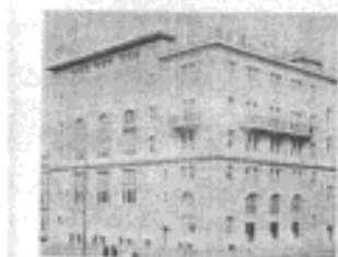
25 YEARS OF COMMUNITY SERVICE IN THE BRONX

Cover of booklet celebrating the 25th anniversary of the DOCS Fulton Correctional Facility in the Bronx. A complete web version appears on the NYCHS site with its own accessing icon at www.correctionhistory.org