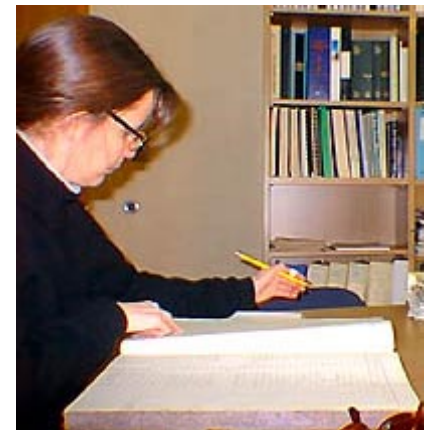
NYCHS Archives' first researcher, Stacy Horn, wields her No. 2 pencil making notes while studying a 127-year ledger of Potter's Field burials.