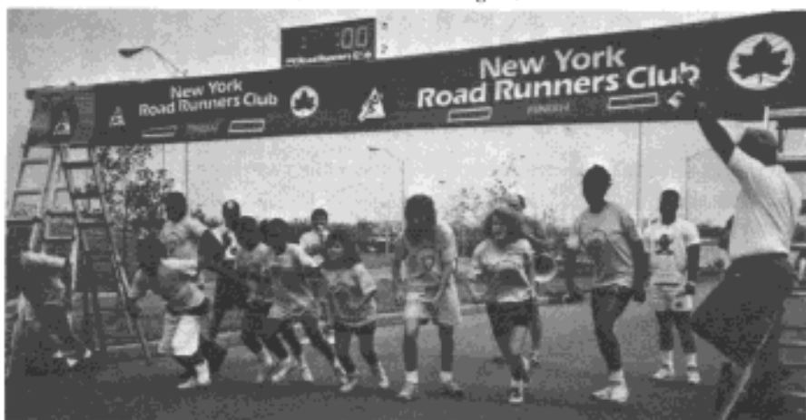
CORRECTION CAPTAINS AND KIDS race off at the sound of the starting blast in the annual Rikers Island Run.