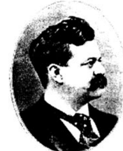
Robert A. Van Wyck First Greater NY Mayor