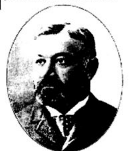
Richard Croker Tammany Hall Leader

Among Mayor Strong's most important appointments was naming Theodore Roosevelt as Police Commissioner. Former Assemblyman Roosevelt, who served as U.S. Civil Service commissioner in President Harrison's administration, promoted the merit system approach within the Police Department as Commissioner.