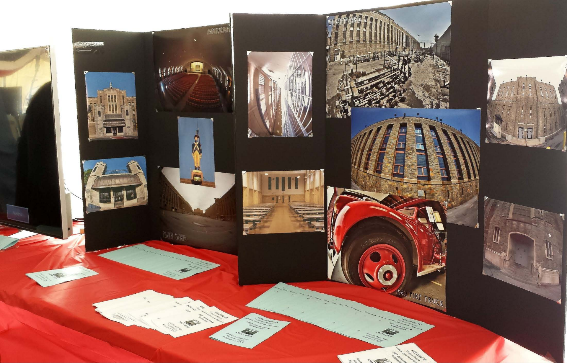
Photos, program copies at an ACF tent table.