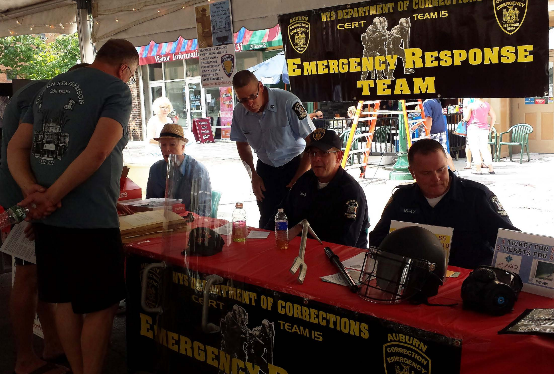
ACF's CERT table display attracts interest.