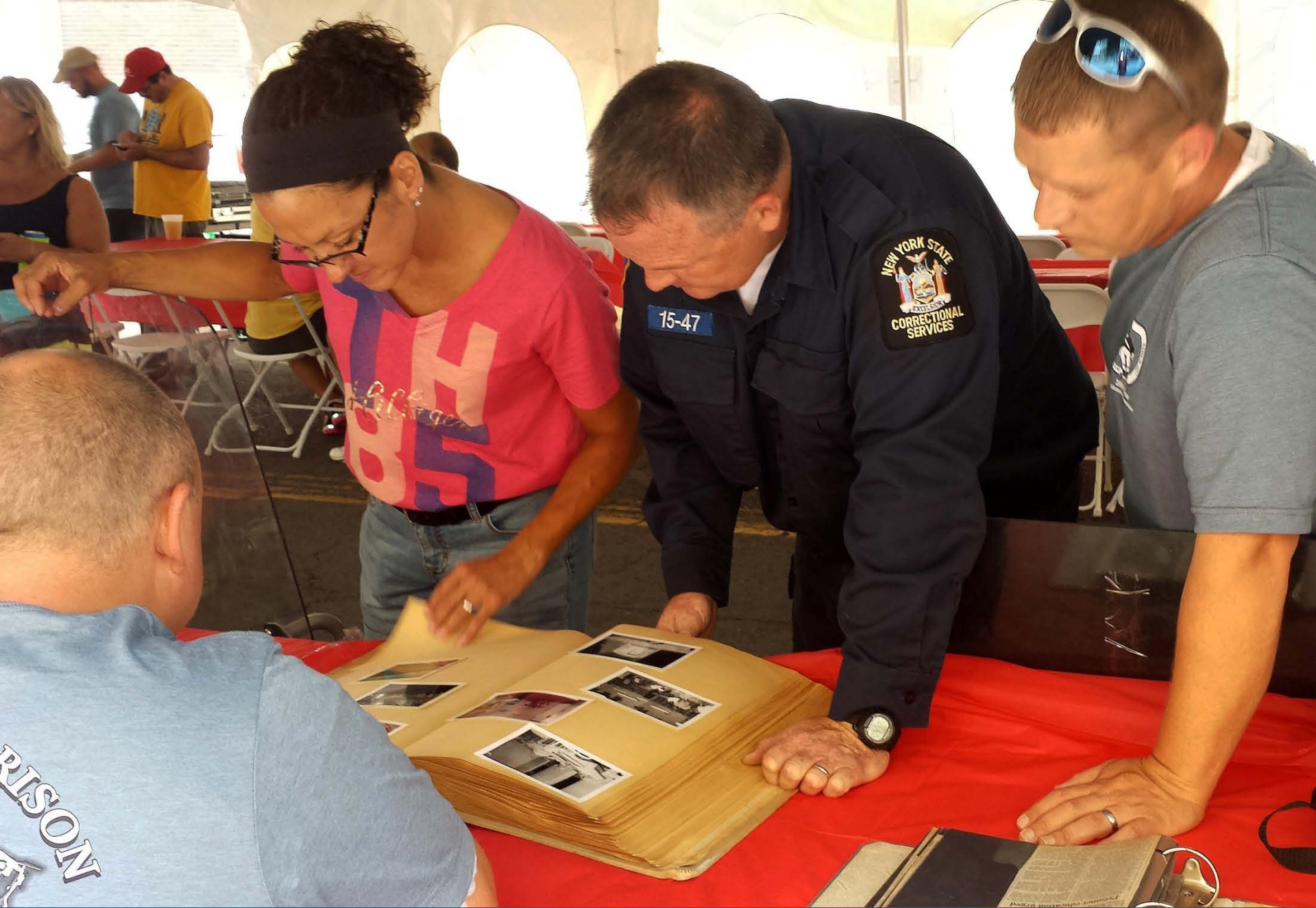
CorrectionHistory.Org display draws attention.