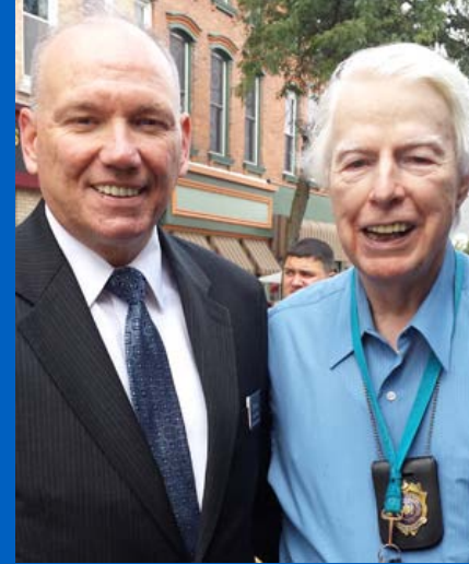
Dep. Commissioner J.F. Bellnier